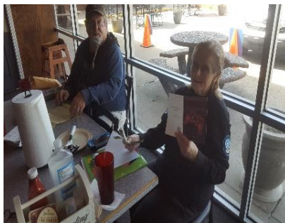
May Meeting & Birthday